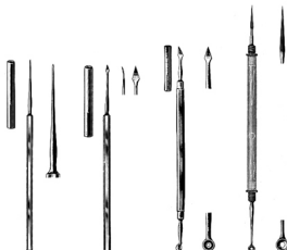
21.0090.00 Biopsy set for taking skin specimen core drills 1.5, 3.0, 4.5mm